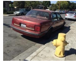
Parking too close to a Fire Hydrant