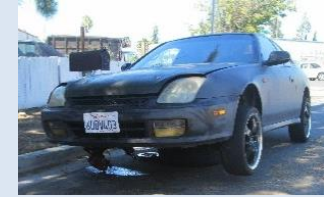
Vehicle being Repaired