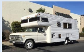
Other Uses of Vehicles