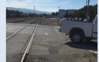
Parking Upon or Near Railroad