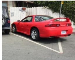
Parking in a NON Parking Spot

22511.7 or 22511.8, unless the vehicle displays either a special identification license plate issued pursuant to Section 5007 or a distinguishing placard issued pursuant to parked in the stall or space.