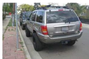
Parking Wrong Way