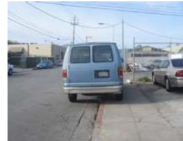
Parking on Sidewalk