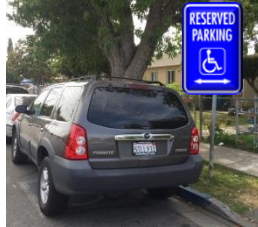
Parking in Disabled Spaces

22507.8. (a) It is unlawful for any person to park or leave standing any vehicle in a stall or space designated for disabled persons and disabled veterans pursuant to Section.