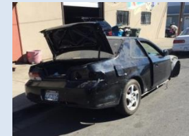
Vehicle Missing Parts